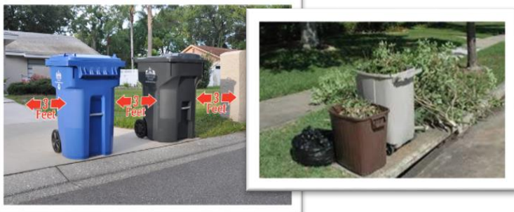
Proper receptacle and yard waste placement

Containers should be stored out of sight on non-collection days.