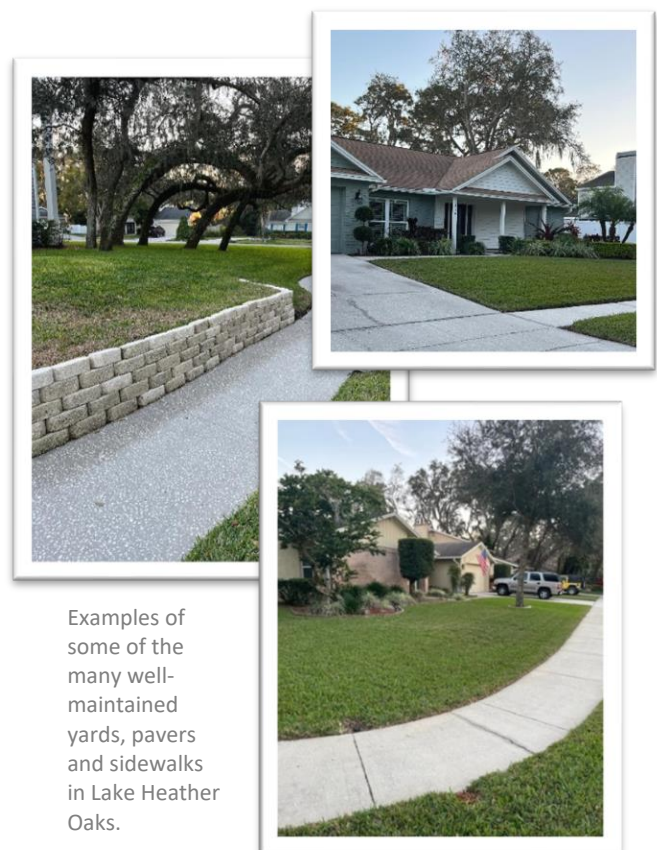
Examples of some of the many well-maintained yards, pavers and sidewalks in Lake Heather Oaks.

As we strive to hold our neighborhood to the standards set forth in our Deed Restrictions, the collective efforts of each homeowner to maintain a clean, well-manicured property are appreciated.