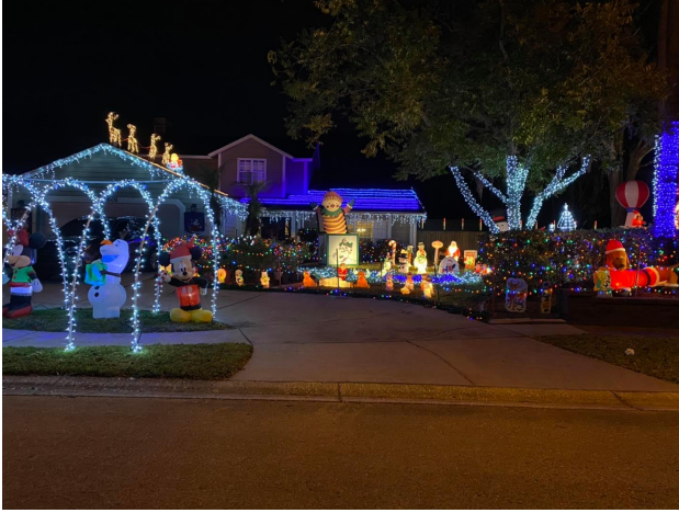
Most Festive Lee & Sylvia Webster 16601 Vallely Drive