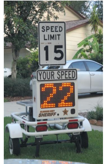
This speed-monitoring device for vehicles is now on Valley Drive.

Join us on Facebook! "Friend us" at Lake Heather Oaks